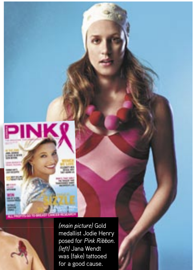
(main picture) Gold medallist Jodie Henry posed for Pink Ribbon . (left) Jana Wendt was (fake) tattooed for a good cause.

And that's the best news of all in this mainly happy story. Namely, that breast-cancer statistics